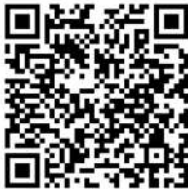
Scan to watch the podcast on YouTube

A new episode of the podcast will be aired every 2 weeks on YouTube, and then shared across communication channels of Filmore Development and Vietcetera ■