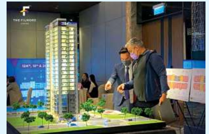
PROJECT LAUNCHING IN HONGKONG