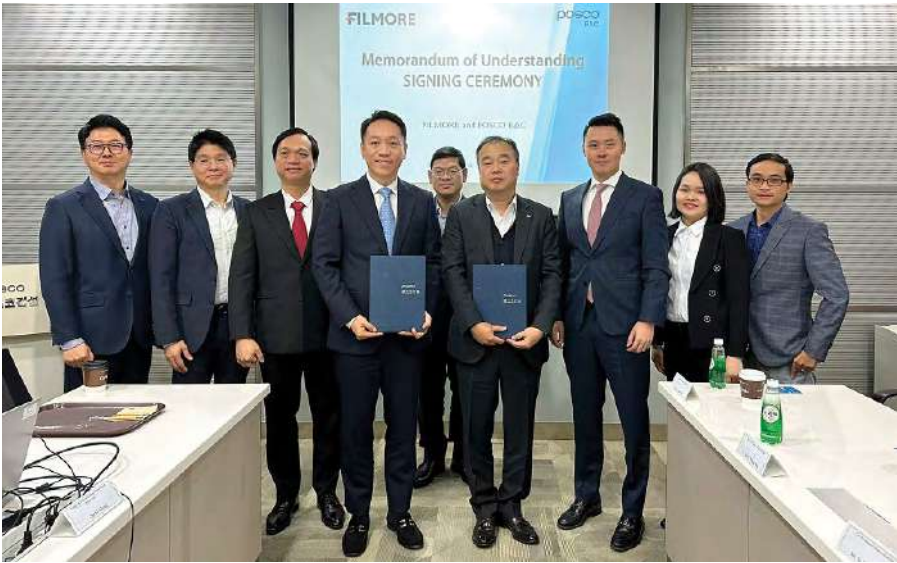
Representatives from Filmore Development & POSCO E&C at the signing event.

Filmore Development and POSCO E&C (Korea) had announced the signing of a Memorandum of Understanding (MOU) for a major cooperation between the two parties in March 2023. The main goal of this cooperation is to enable the possibilities of prospective