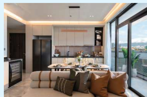
UNVEILING 3 MOCK-UP UNITS