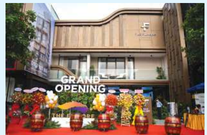
SALES GALLERY OPENING CEREMONY