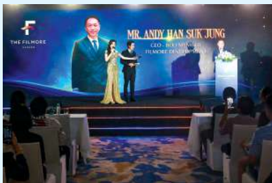
LAUNCHING CEREMONY IN DA NANG