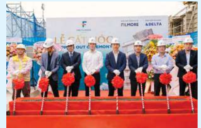
TOPPING OUT CEREMONY