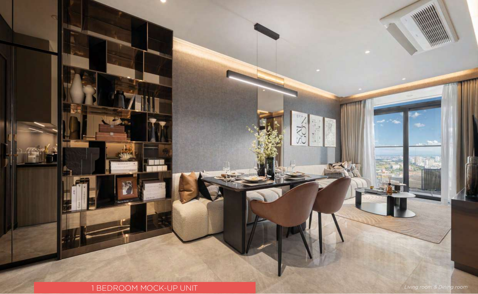
1 BEDROOM MOCK-UP UNIT