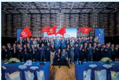
KICK-OFF EVENT IN HCMC