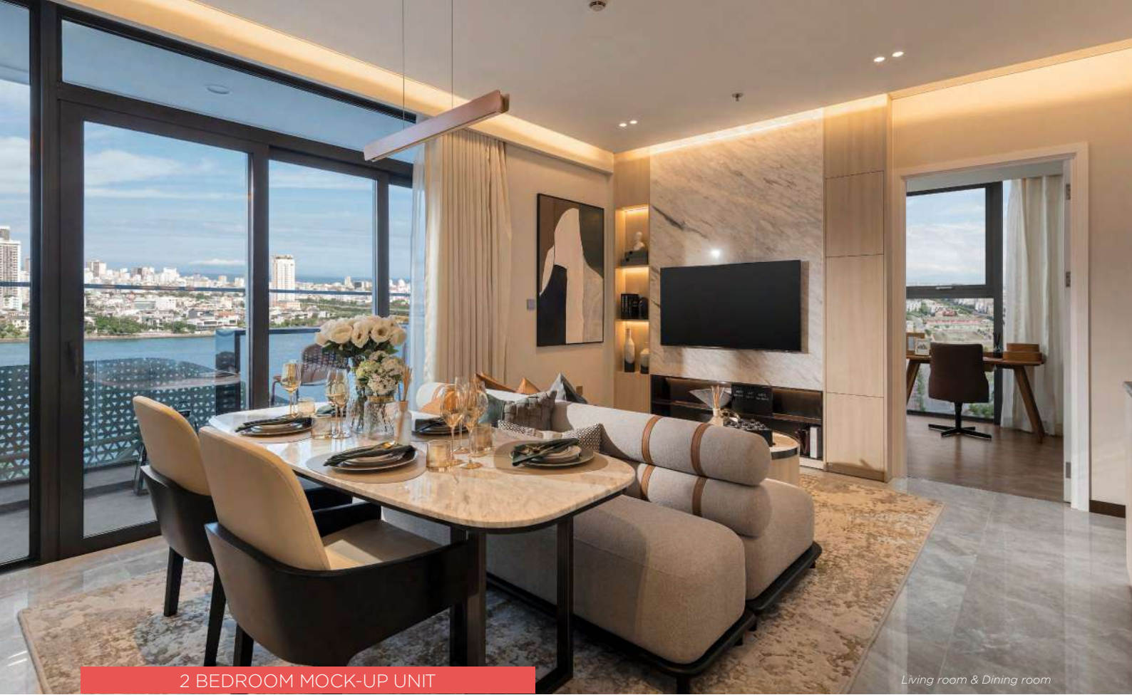
2 BEDROOM MOCK-UP UNIT