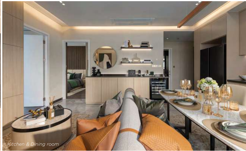
Kitchen & Dining room

The bathroom area is meticulously finished with luxurious marble porcelain tile floors, equipped with full sanitary fittings from Kohler.