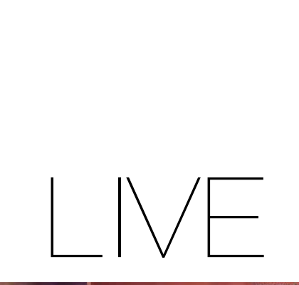
Happy Birthday Filmorean