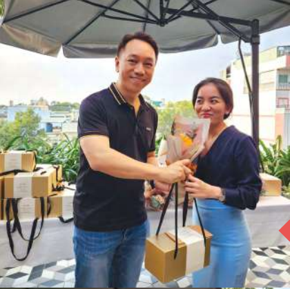
Women's day 8/3